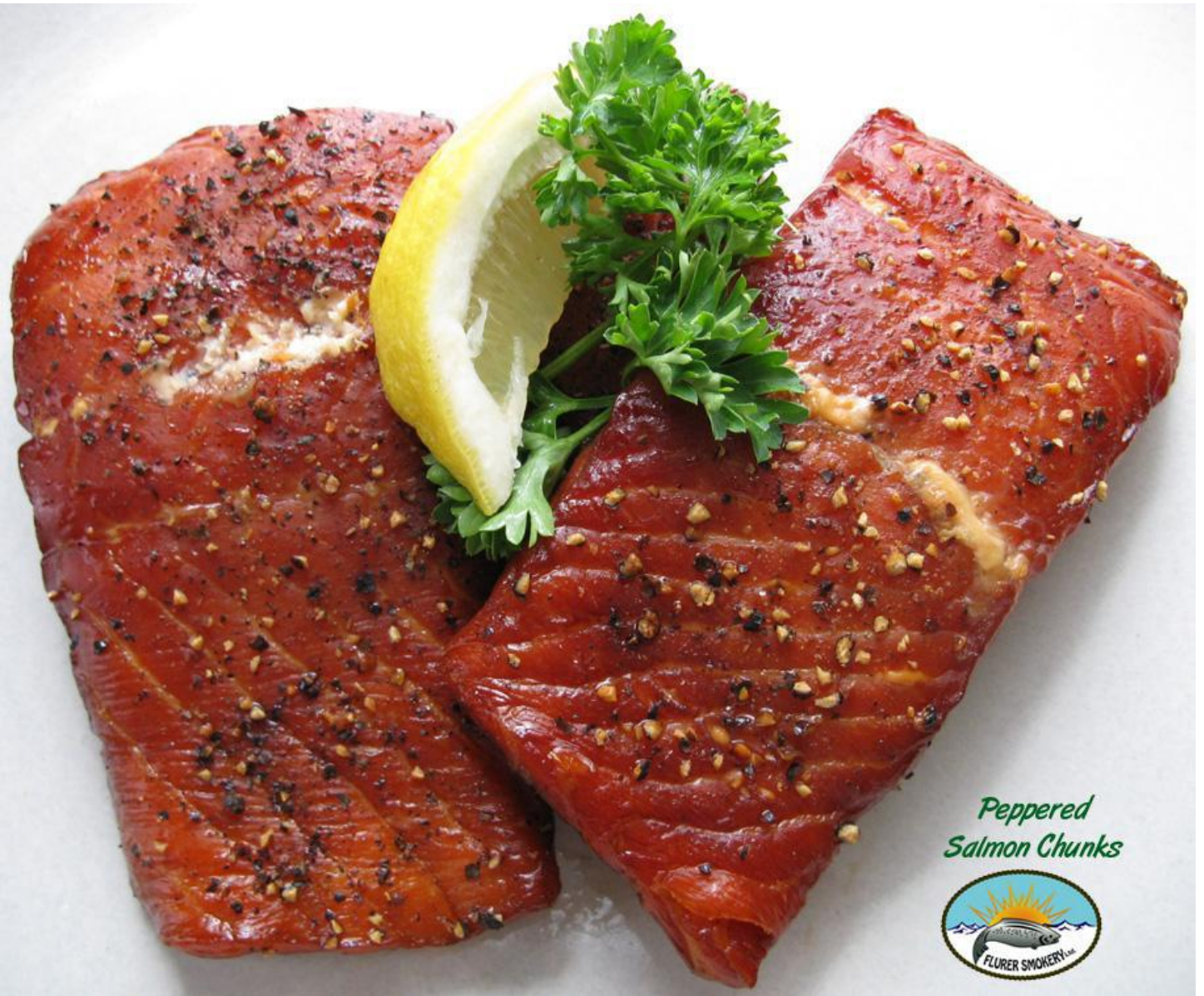
Peppered Salmon Chunks