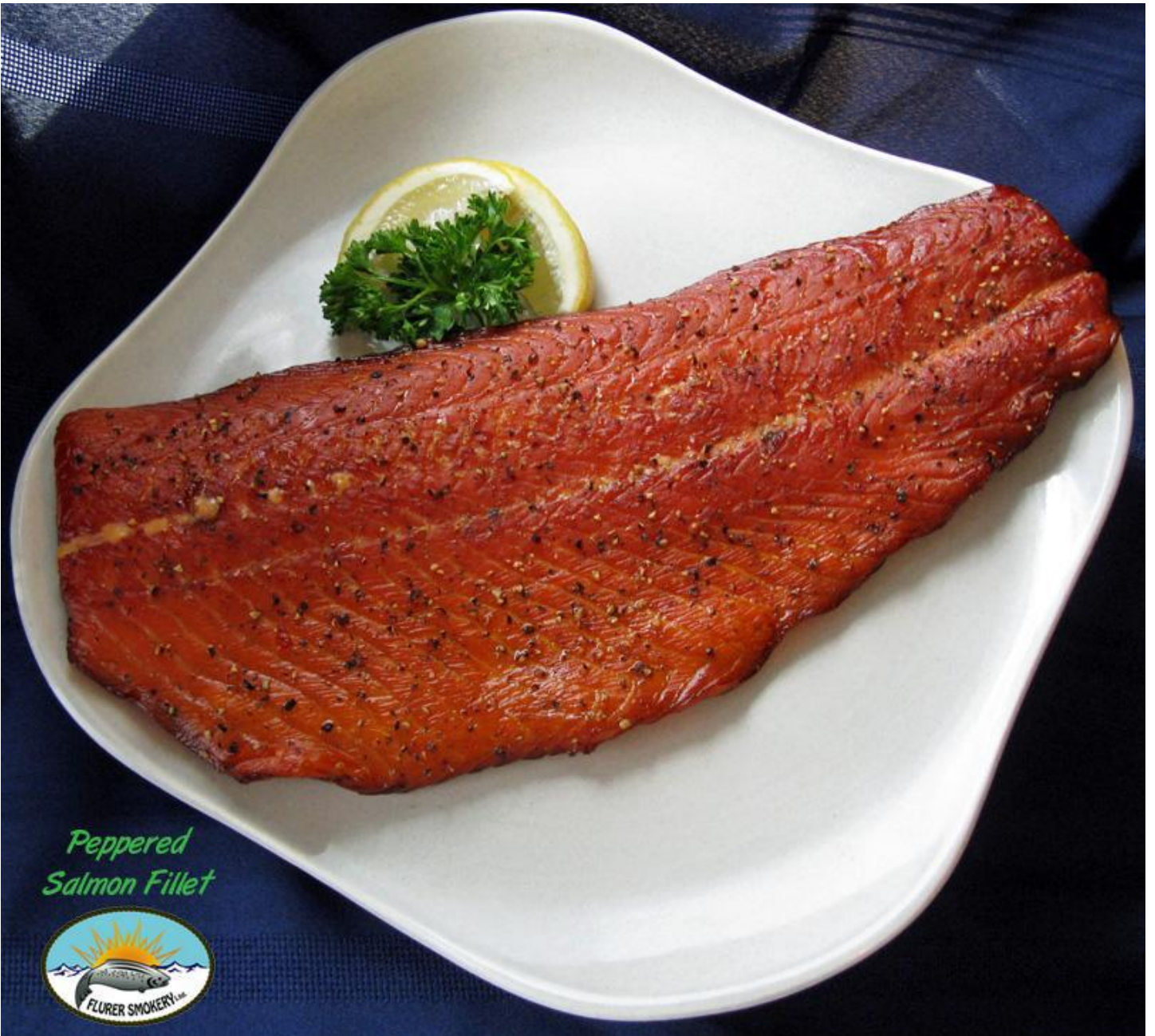
Peppered Salmon Fillet